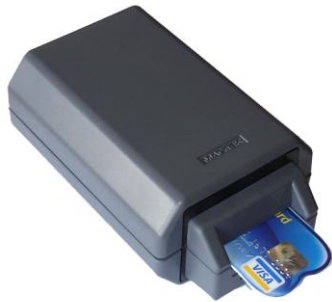
MOTORIZED READER- CONTACT CHIP + MAGSTRIPE

Quick and easy EMV Card Data Viewer; Hyperlinked Data Displays. Contact and Contactless Reader Options. Personalised EMV card browser/viewer for all Payment Schemes. PCI DSS and PA-DSS security features. Test data export to Barnes CPT and CAT 3000v3 for remote Data Validation.