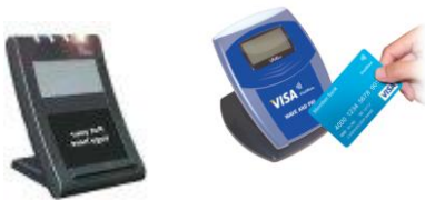
CPE 3000v3CL CONTACTLESS OPTION - CL READER (SELECTED FROM OTI, VIVOPAY etc)